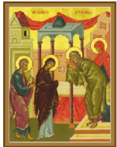
Post-feast of the Encounter

Today the gates of heaven swing open, for the Word of the Father Who has no beginning has received beginning in time without any loss to His divinity. As a child of forty days He is offered by a virgin Mother in the Temple according to the Law. The Elder Simeon receives Him in his arms and cries out: Dismiss me, o Master, for my eyes have seen Your salvation; O Lord, Who came into the world to save us, glory to You!